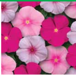
Bubble Gum Mixture