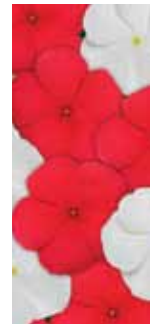
Red And White Mixture