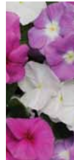
Summer Breeze Mixture