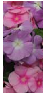
Cotton Candy Mixture