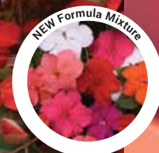
NEW Formula Mixture