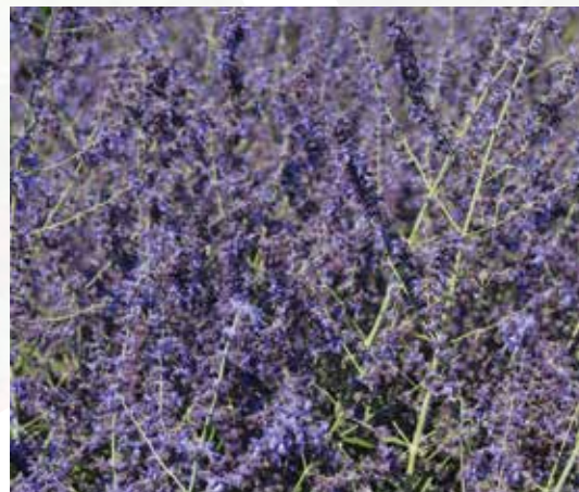
'CRAZYBLUE' PEROVSKIA ●

Height: 28 to 36 in. (71 to 91 cm) Spread: 24 to 30 in. (61 to 76 cm)