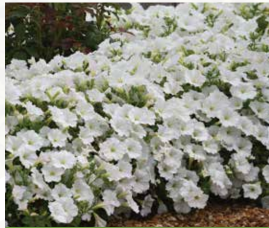
COLORRUSH™ WHITE PETUNIA ●

Height: 10 to 12 in. (25 to 30 cm) Spread: 24 to 36 in. (61 to 91 cm)