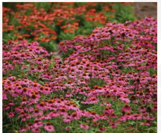
POWWOW® WILD BERRY ECHINACEA ●

Height: 16 to 20 in. (41 to 51 cm) Spread: 16 to 20 in. (41 to 51 cm)