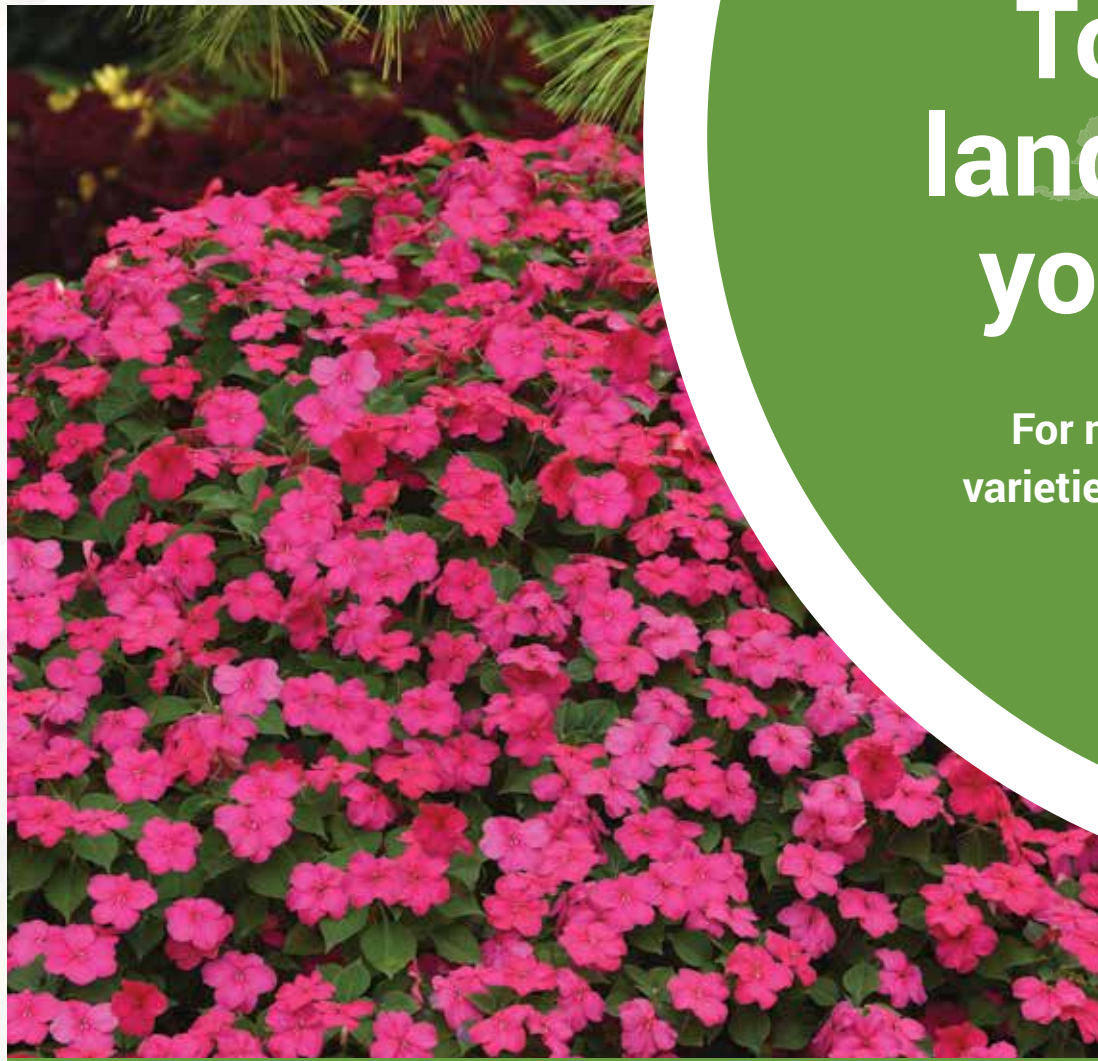
NEW BEACON® ROSE IMPATIENS ●●

Height: 16 to 20 in. (41 to 51 cm) Spread: 16 to 20 in. (41 to 51 cm)