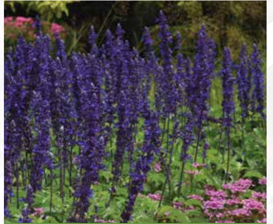
MYSTIC SPIRES SALVIA ●

Height: 12 to 32 in. (30 to 81 cm) Spread: 12 to 26 in. (30 to 66 cm)