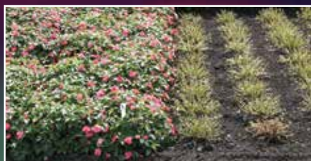
BEACON VS. OTHER IMPATIENS

Visit ballseed.com/beaconimpatiens for more information.