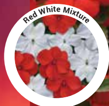
Red White Mixture