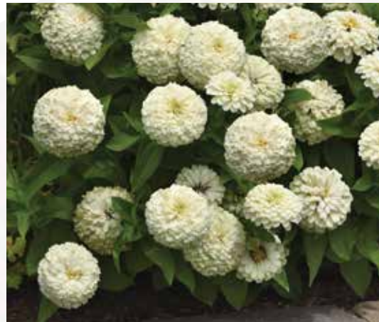
ZESTY™ ZINNIA SERIES ●

Height: 18 to 24 in. (46 to 61 cm) Spread: 18 to 24 in. (46 to 61 cm)