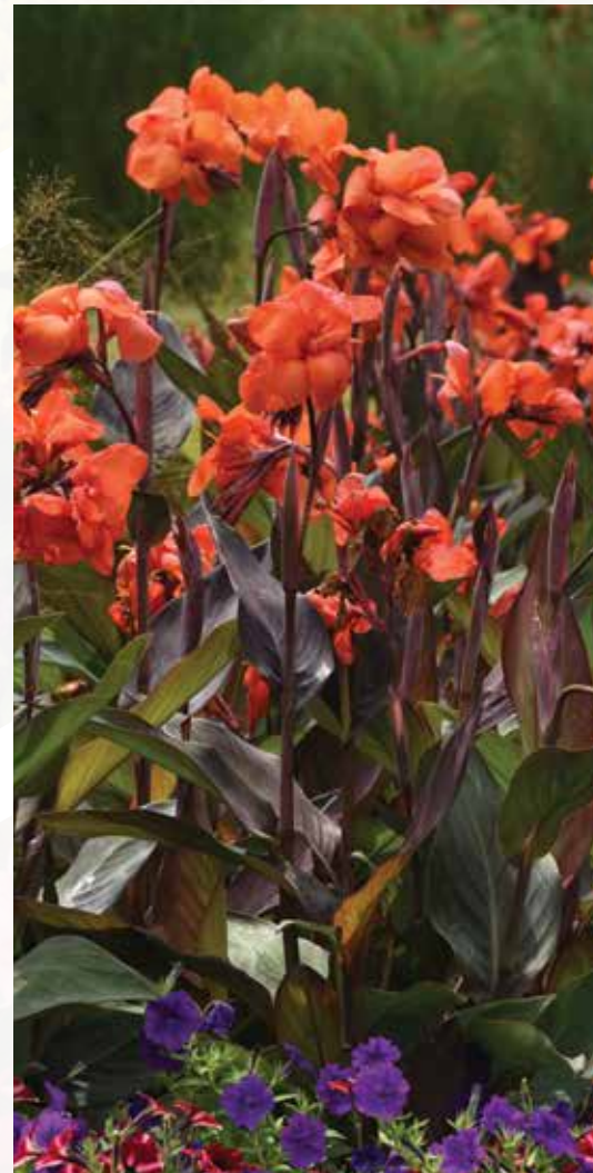
CANNOVA® CANNA SERIES ●

Height: 18 to 24 in. (46 to 61 cm) Spread: 18 to 24 in. (46 to 61 cm)