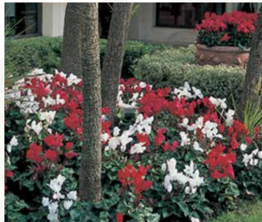
LATINIA® CYCLAMEN SERIES ●

Height: 12 to 16 in. (30 to 41 cm) Spread: 12 to 14 in. (30 to 36 cm)