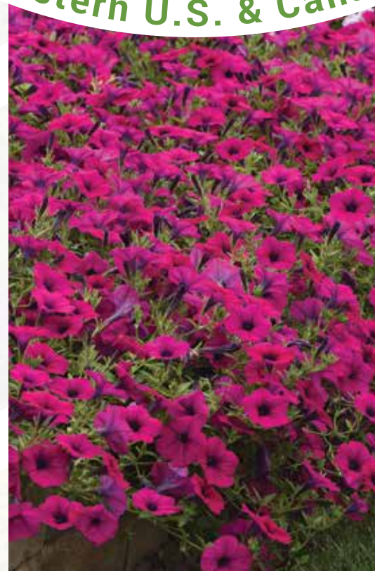
WAVE® PURPLE CLASSIC PETUNIA ●

Height: 10 to 14 in. (25 to 36 cm) Spread: 10 to 14 in. (25 to 36 cm)