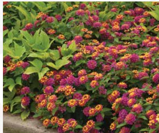
LUCKY™ LANTANA SERIES ●

Height: 18 to 24 in. (46 to 61 cm) Spread: 12 to 18 in. (30 to 46 cm)