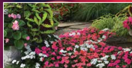
NORTH TO SOUTH, EAST TO WEST, BEACON WORKS!