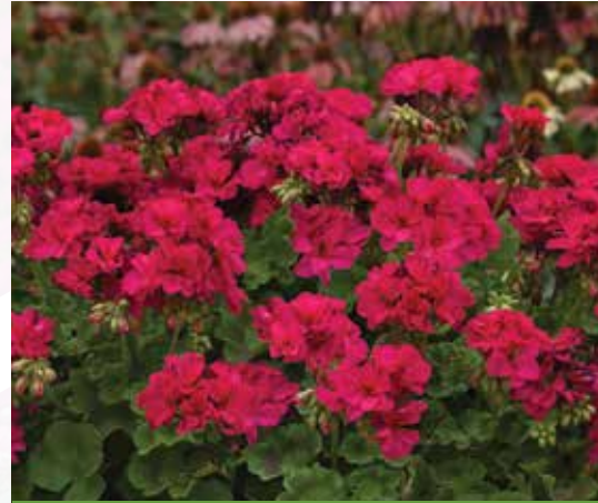
GALAXY™ ZONAL GERANIUM SERIES ●

Height: 10 to 12 in. (25 to 30 cm) Spread: 24 to 36 in. (61 to 91 cm)