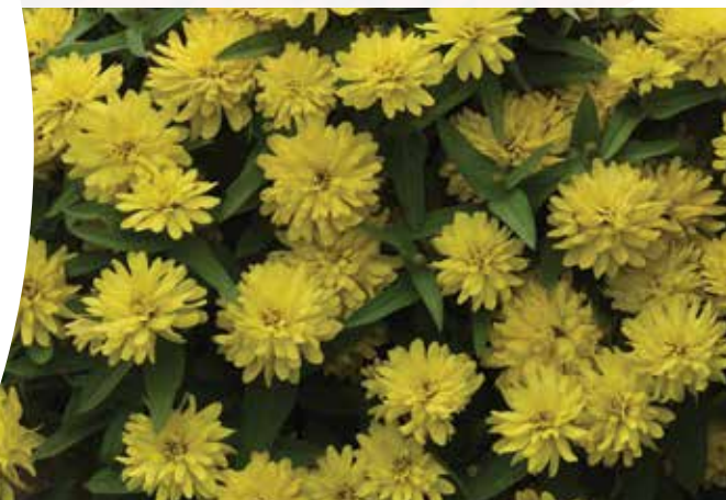
NEW DOUBLE ZAHARA™ YELLOW IMPROVED ZINNIA ●

Height: 15 to 20 in. (38 to 51 cm) Spread: 12 to 14 in. (30 to 36 cm)