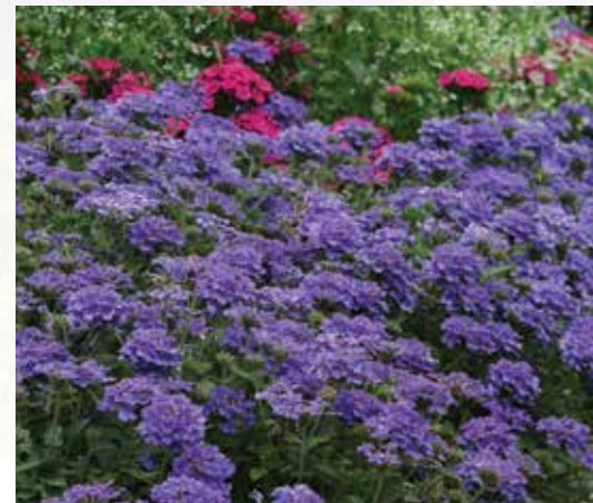
ENDURASCAPE™ BLUE VERBENA ●

Height: 5 to 7 in. (13 to 18 cm) Spread: 36 to 48 in. (91 to 122 cm)