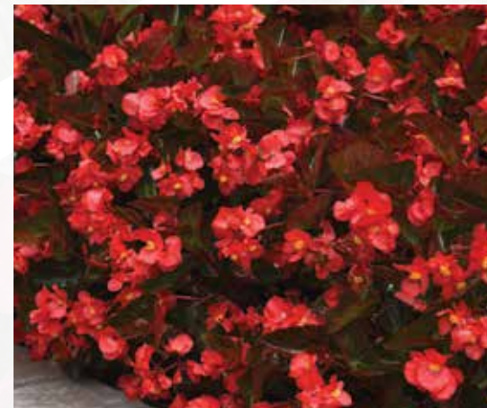
MEGAWATT™ BEGONIA SERIES ●●

Height: 20 to 28 in. (51 to 71 cm) Spread: 16 to 24 in. (41 to 61 cm)