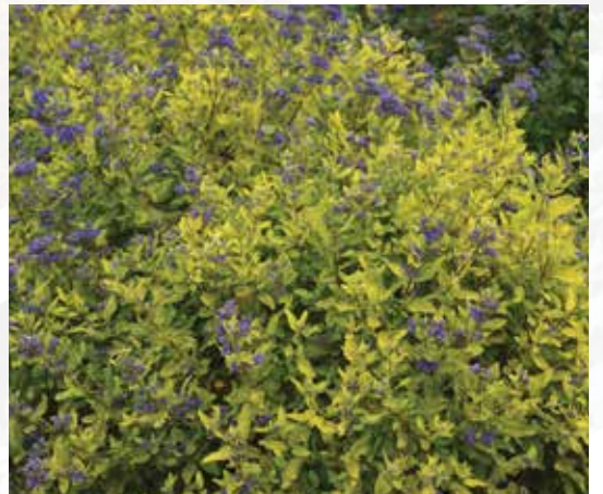
'GOLD CREST' CARYOPTERIS ●●

Height: 10 to 12 in. (25 to 30 cm) Spread: 10 to 12 in. (25 to 30 cm)