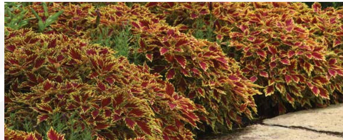
NEW FLAMETHROWER™ CAJUN SPICE COLEUS ●●

Height: 16 to 18 in. (41 to 46 cm) Spread: 14 to 16 in. (36 to 41 cm)