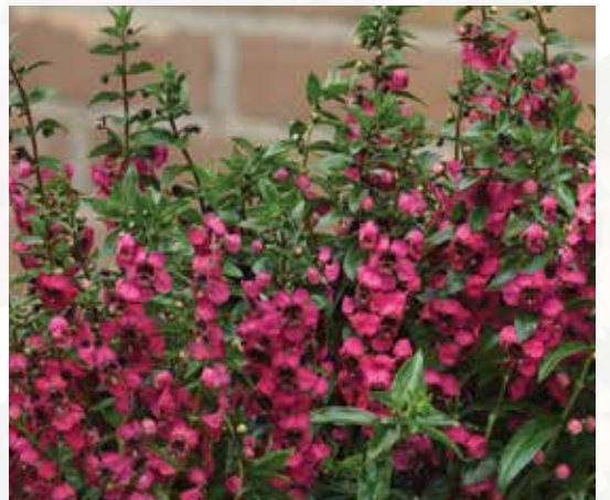
SERENITA® ROSE ANGELONIA ●

Height: 20 to 28 in. (51 to 71 cm) Spread: 16 to 24 in. (41 to 61 cm)