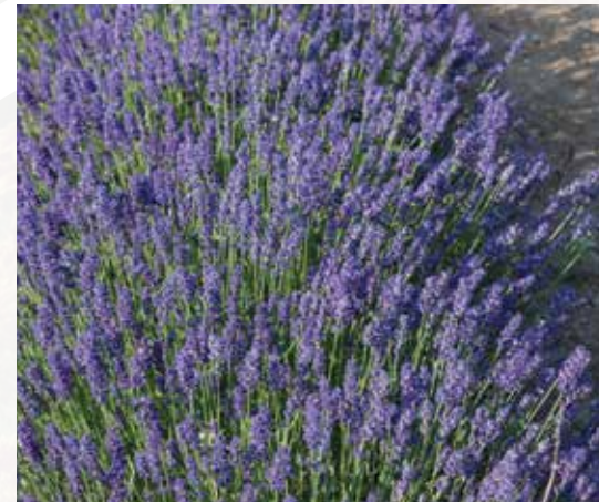
'SUPERBLUE' LAVENDER ●

Height: 18 to 20 in. (46 to 51 cm) Spread: 22 to 24 in. (56 to 61 cm)