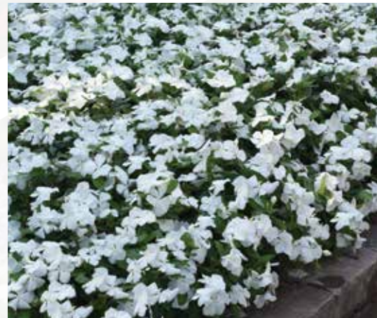
TITAN™ VINCA SERIES ●

Height: 14 to 16 in. (36 to 41 cm) Spread: 10 to 12 in. (25 to 30 cm)