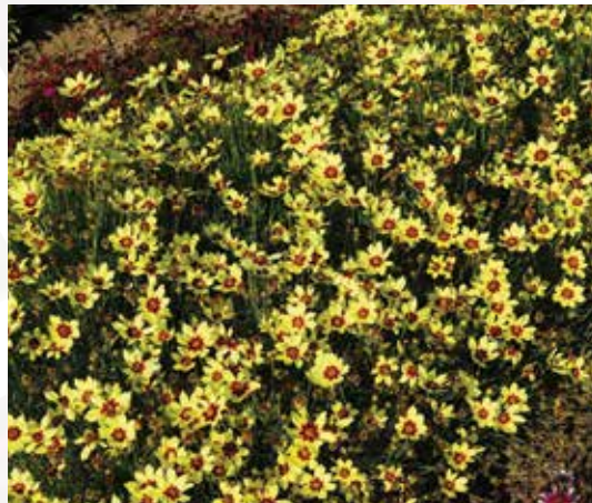
'ELECTRIC SUNSHINE' COREOPSIS ●

Height: 14 to 16 in. (36 to 41 cm) Spread: 10 to 12 in. (25 to 30 cm)