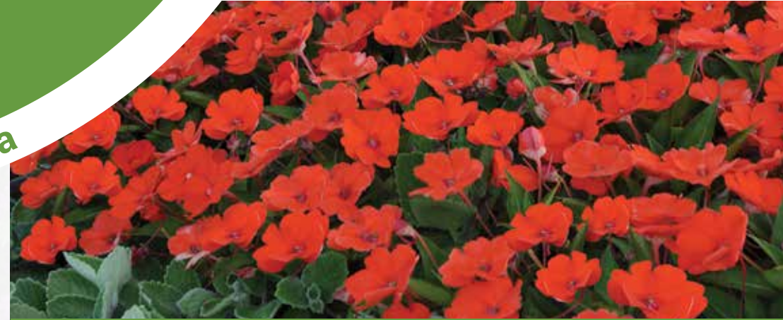
SUNPATIENS® COMPACT ELECTRIC ORANGE INTERSPECIFIC IMPATIENS ●

Height: 16 to 20 in. (41 to 51 cm) Spread: 12 to 16 in. (30 to 41 cm)