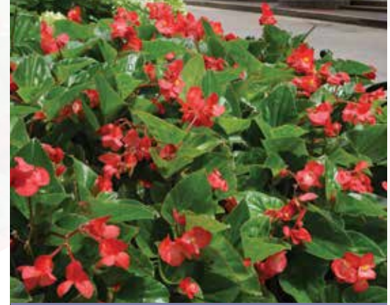
DRAGON WING® BEGONIA SERIES • Height: 12 to 15 in. (30 to 38 cm) Spread: 15 to 18 in. (38 to 46 cm)