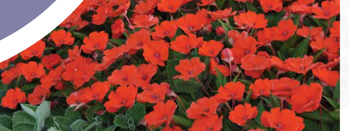
UNPATIENS® COMPACT ELECTRIC ORANGE INTERSPECIFIC IMPATIENS 🔾