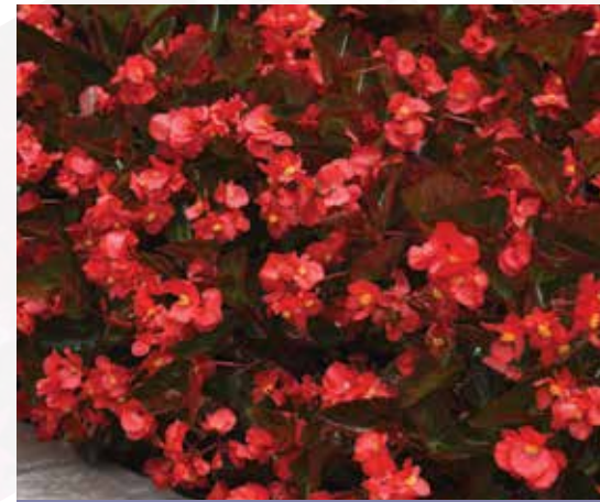
MEGAWATT™ BEGONIA SERIES ♥ ♥