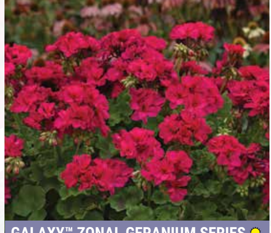
LAXY™ ZONAL GERANIUM SERIES •