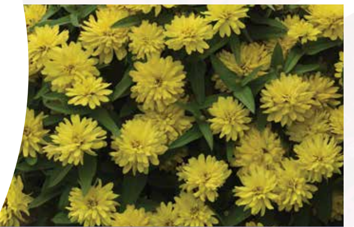
NEW DOUBLE ZAHARA™ YELLOW IMPROVED ZINNIA •