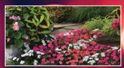
BEACON VS. OTHER IMPATIENS