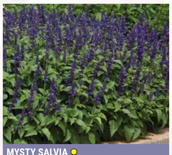
MYSTY SALVIA 🔾 leight: 12 to 18 in. (30 to 46 cm) pread: 12 to 18 in. (30 to 46 cm)