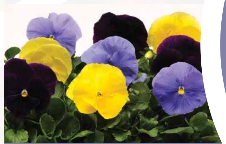
MATRIX® TRICOLOR MIX PANSY ••