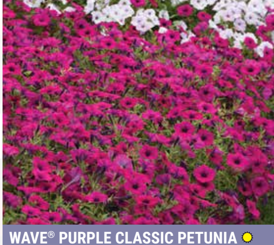
leight: 5 to 7 in. (13 to 18 cm) Spread: 36 to 48 in. (91 to 122 cm)