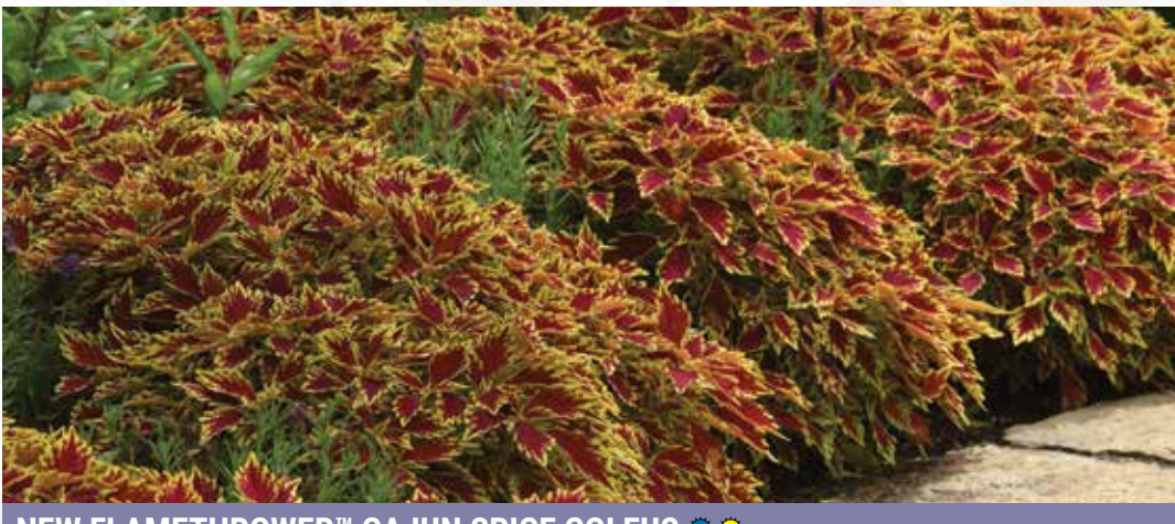
NEW FLAMETHROWER™ CAJUN SPICE COLEUS ○○