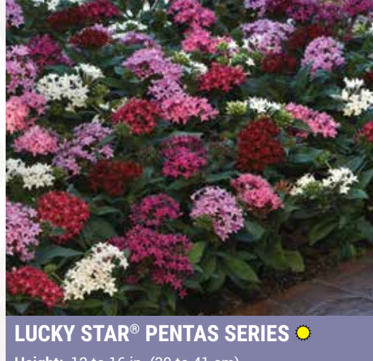
eight: 12 to 16 in. (30 to 41 cm) pread: 12 to 14 in. (30 to 36 cm)