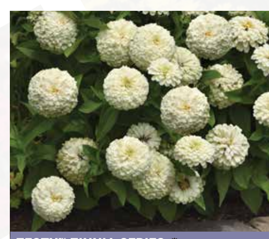
ZESTY™ ZINNIA SERIES • Height: 18 to 24 in. (46 to 61 cm) Spread: 18 to 24 in. (46 to 61 cm)