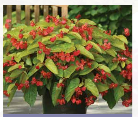
NARY WINGS' BEGONIA 🗢