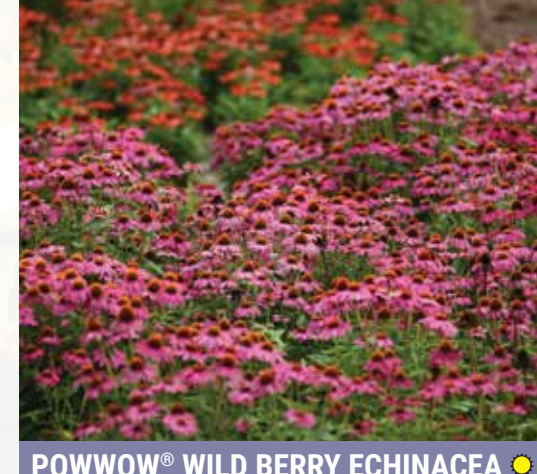
POWWOW® WILD BERRY ECHINACEA • leight: 16 to 20 in. (41 to 51 cm) pread: 12 to 16 in. (30 to 41 cm)