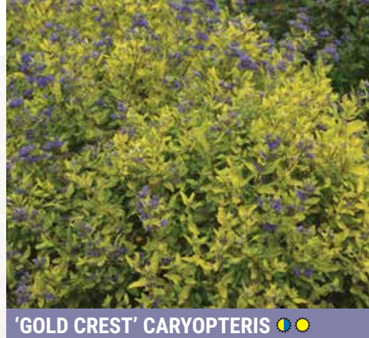
eight: 28 to 36 in. (71 to 91 cm) pread: 24 to 30 in. (61 to 76 cm)