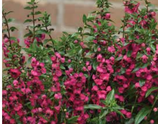
SERENITA® ROSE ANGELONIA 🗢