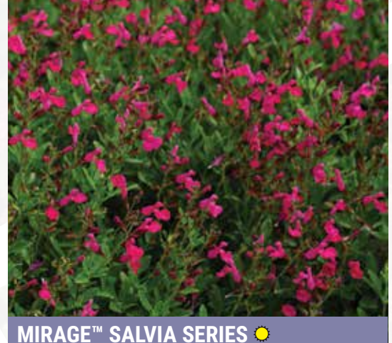
Height: 12 to 14 in. (30 to 36 cm) Spread: 14 to 16 in. (36 to 41 cm)