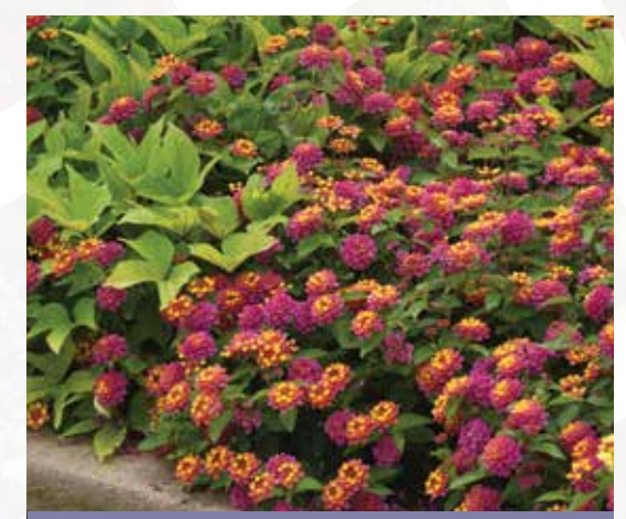
LUCKY™ LANTANA SERIES • Height: 12 to 16 in. (30 to 41 cm) Spread: 12 to 14 in. (30 to 36 cm)