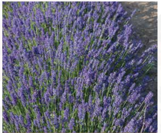
'SUPERBLUE' LAVENDER ●

Height: 14 to 16 in. (36 to 41 cm) Spread: 10 to 12 in. (25 to 30 cm)