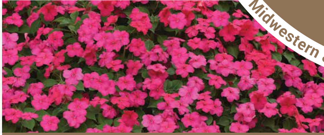
NEW BEACON® ROSE IMPATIENS ●●●

Height: 12 to 18 in. (30 to 46 cm) Spread: 15 to 18 in. (38 to 46 cm)