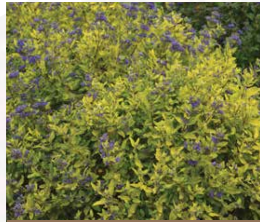
'GOLD CREST' CARYOPTERIS ●●

Height: 20 to 28 in. (51 to 71 cm) Spread: 16 to 24 in. (41 to 61 cm)