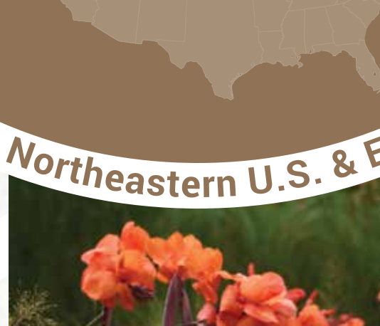
CANNOVA® CANNA SERIES ●

Height: 15 to 20 in. (38 to 51 cm) Spread: 12 to 14 in. (30 to 36 cm)