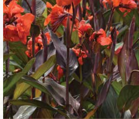
CANNOVA® CANNA SERIES ●

Height: 18 to 24 in. (46 to 61 cm) Spread: 12 to 18 in. (30 to 46 cm)