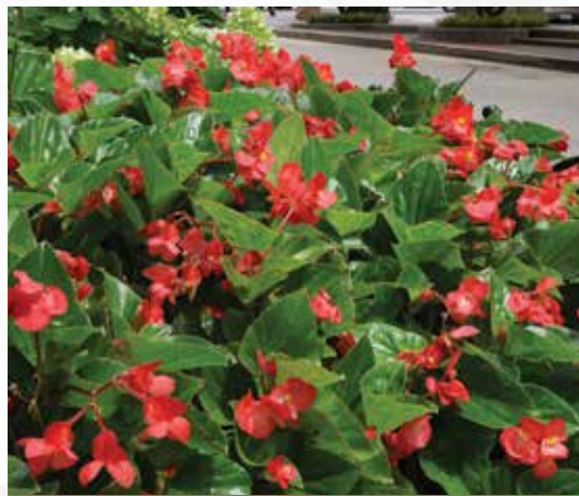
DRAGON WING® BEGONIA SERIES ●

Height: 12 to 16 in. (30 to 41 cm) Spread: 12 to 14 in. (30 to 36 cm)