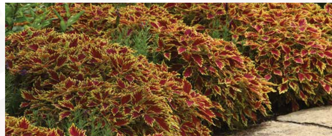
NEW FLAMETHROWER™ CAJUN SPICE COLEUS ●●

Height: 20 to 22 in. (51 to 56 cm) Spread: 18 to 22 in. (46 to 56 cm)