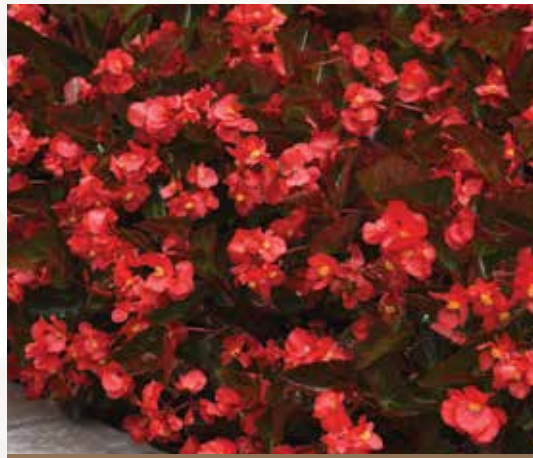
MEGAWATT™ BEGONIA SERIES ●●●

Height: 16 to 18 in. (41 to 46 cm) Spread: 14 to 16 in. (36 to 41 cm)