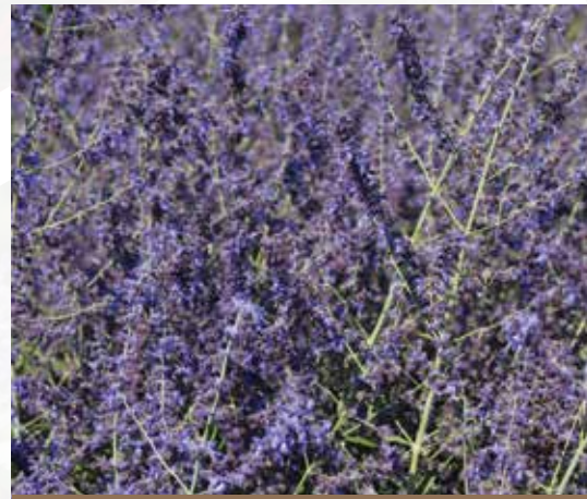
'CRAZYBLUE' PEROVSKIA ●

Height: 10 to 12 in. (25 to 30 cm) Spread: 10 to 12 in. (25 to 30 cm)