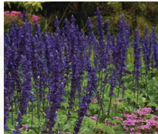
MYSTIC SPIRES SALVIA ●

Height: 12 to 15 in. (30 to 38 cm) Spread: 15 to 18 in. (38 to 46 cm)