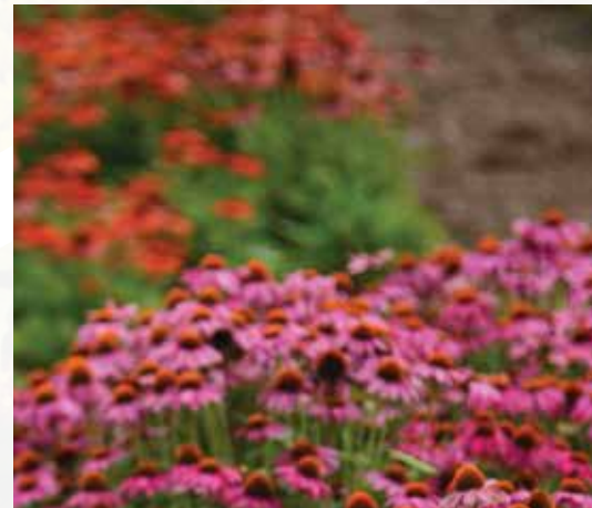
POWWOW® WILD BERRY ECHINACEA ●

Height: 28 to 36 in. (71 to 91 cm) Spread: 24 to 30 in. (61 to 76 cm)