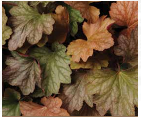
CARNIVAL HEUCHERA SERIES ●●●

Height: 18 to 20 in. (46 to 51 cm) Spread: 22 to 24 in. (56 to 61 cm)