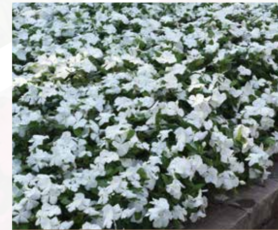
TITAN™ VINCA SERIES ●

Height: 5 to 7 in. (13 to 18 cm) Spread: 36 to 48 in. (91 to 122 cm)