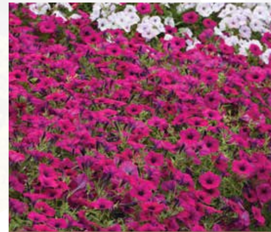
WAVE® PURPLE CLASSIC PETUNIA ●

Height: 30 to 48 in. (76 to 122 cm) Height: 14 to 20 in. (36 to 51 cm)