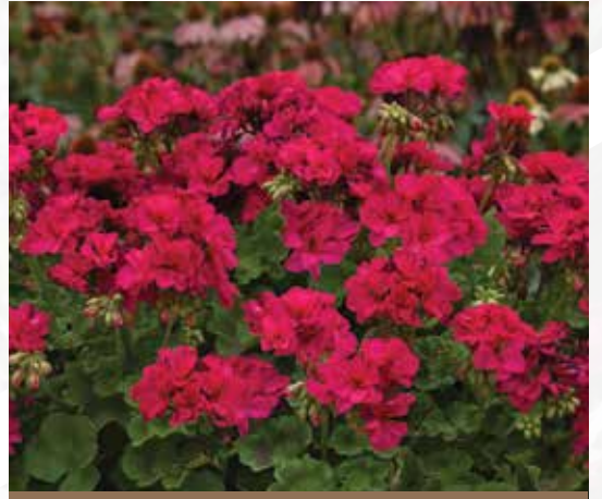
GALAXY™ ZONAL GERANIUM SERIES ●

Height: 12 to 32 in. (30 to 81 cm) Spread: 12 to 26 in. (30 to 66 cm)