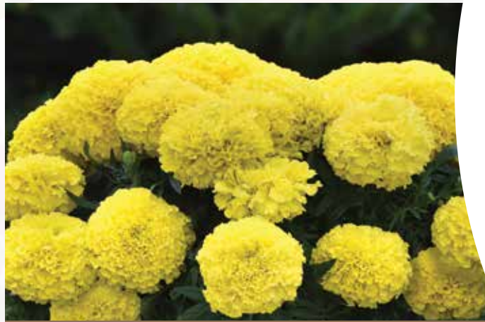
MARVEL II™ AFRICAN MARIGOLD SERIES ●

Height: 18 to 24 in. (46 to 61 cm) Spread: 18 to 24 in. (46 to 61 cm)