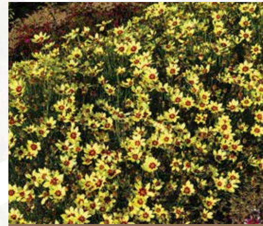
'ELECTRIC SUNSHINE' COREOPSIS ●

Height: 16 to 20 in. (41 to 51 cm) Spread: 12 to 16 in. (30 to 41 cm)