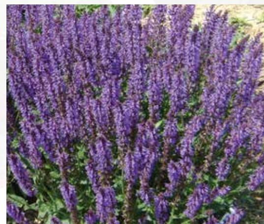
'BLUE BY YOU' SALVIA ●

Height: 10 to 12 in. (25 to 30 cm) Spread: 12 to 14 in. (30 to 36 cm)