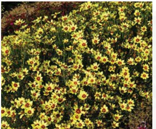
'ELECTRIC SUNSHINE' COREOPSIS ●

Height: 12 to 18 in. (30 to 46 cm) Spread: 16 to 18 in. (41 to 46 cm)