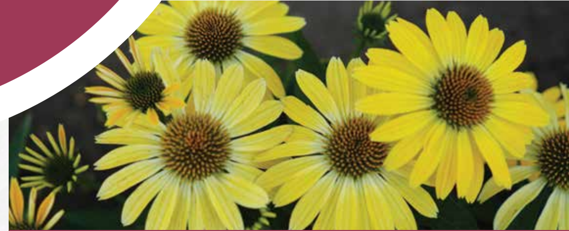
SOMBRERO® SUMMER SOLSTICE ECHINACEA ●

Height: 5 to 7 in. (13 to 18 cm) Spread: 36 to 48 in. (91 to 122 cm)