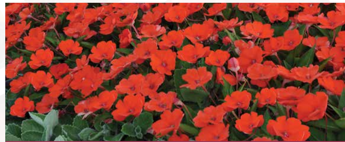
SUNPATIENS® COMPACT ELECTRIC ORANGE INTERSPECIFIC IMPATIENS ●

Height: 12 to 16 in. (30 to 41 cm) Spread: 12 to 14 in. (30 to 36 cm)