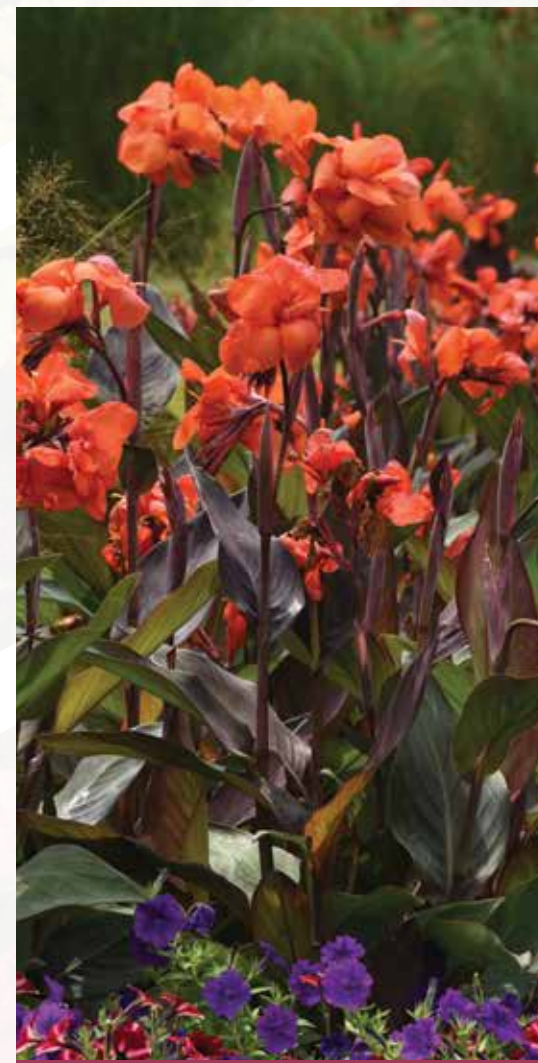
CANNOVA® CANNA SERIES ●

Height: 12 to 18 in. (30 to 46 cm) Spread: 12 to 18 in. (30 to 46 cm)