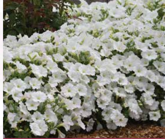
COLORRUSH™ WHITE PETUNIA ●

Height: 12 to 18 in. (30 to 46 cm) Spread: 15 to 18 in. (38 to 46 cm)