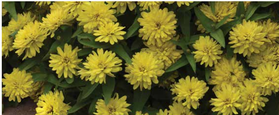
NEW DOUBLE ZAHARA™ YELLOW IMPROVED ZINNIA ●

Height: 12 to 16 in. (30 to 41 cm) Spread: 12 to 14 in. (30 to 36 cm)