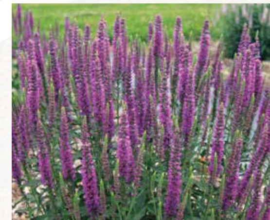
MOODY BLUES® MAUVE VERONICA ●

Height: 28 to 36 in. (71 to 91 cm) Spread: 24 to 30 in. (61 to 76 cm)