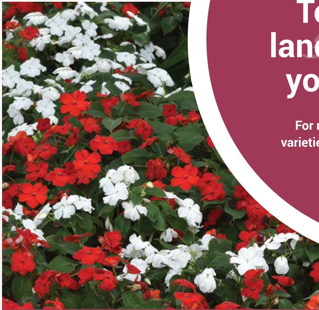
BEACON® RED WHITE MIXTURE IMPATIENS ●●

Height: 10 to 12 in. (25 to 30 cm) Spread: 24 to 36 in. (61 to 91 cm)