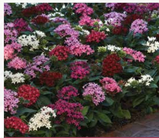
LUCKY STAR® PENTAS SERIES ●

Height: 12 to 14 in. (30 to 36 cm) Spread: 12 to 14 in. (30 to 36 cm)