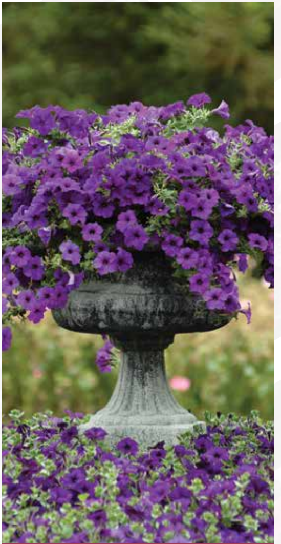
WAVE® PETUNIA SERIES ●

Height: 8 in. (20 cm) Spread: 8 to 10 in. (20 to 25 cm)