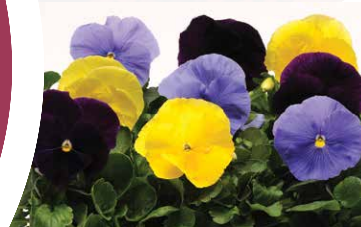
MATRIX® TRICOLOR MIX PANSY ●●

Height: 15 to 20 in. (38 to 51 cm) Spread: 12 to 14 in. (30 to 36 cm)