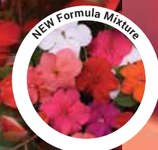
NEW Formula Mixture