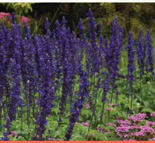
MYSTIC SPIRES SALVIA leight: 18 to 24 in. (46 to 61 cm) spread: 12 to 18 in. (30 to 46 cm)