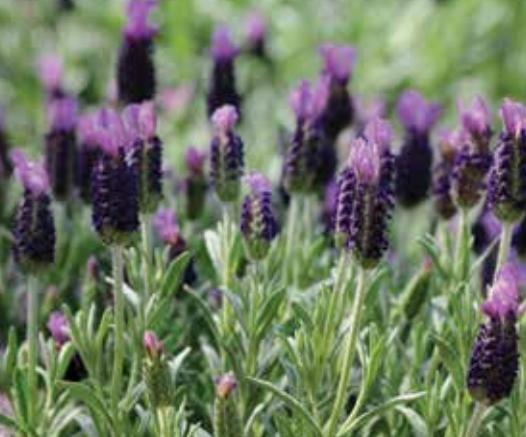
ANOUK LAVANDULA SERIES C Height: 14 to 18 in. (36 to 46 cm) Spread: 12 to 14 in. (30 to 36 cm)