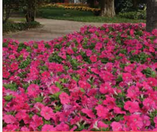
PRETTY FLORA™ PETUNIA SERIES ⊂ leight: 7 to 10 in. (18 to 25 cm) pread: 8 to 12 in. (20 to <u>30 cm</u>)

leight: 8 in. (20 cm) Spread: 8 to 10 in. (20 to 25 cm)