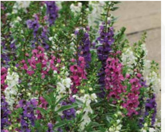
SERENITA® ANGELONIA SERIES O leight: 12 to 14 in. (30 to 36 cm) pread: 12 to 14 in. (30 to 36 cm)

LUCKY™ LANTANA SERIES ○ 12 to 16 in. (30 to 41 cm) 12 to 14 in. (30 to 36 cm)