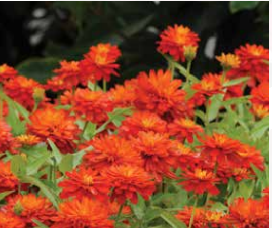
DOUBLE ZAHARA<sup>™</sup> ZINNIA SERIES ○ leight: 16 to 20 in. (41 to 51 cm) Spread: 16 to 20 in. (41 to 51 cm)