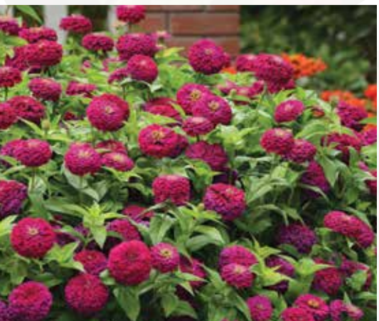
NEW ZESTY<sup>™</sup> ZINNIA SERIES ○ eight: 18 to 24 in. (46 to 61 cm) pread: 18 to 24 in. (46 to 61 cm)

TITAN<sup>™</sup> VINCA SERIES ○ leight: 14 to 16 in. (36 to 41 cm) Spread: 10 to 12 in. (25 to 30 cm)