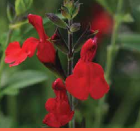
RADIO RED SALVIA O Height: 16 to 18 in. (41 to 46 cm) Spread: 14 to 16 in. (36 to 41 cm)