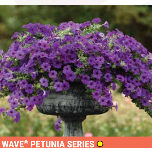
Height: 5 to 7 in. (13 to 18 cm) Spread: 36 to 48 in. (91 to 122 cm)