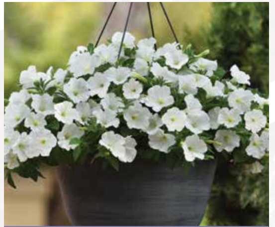
NEW COLORRUSH™ WHITE PETUNIA ●●

Height: 14 to 28 in. (36 to 71 cm) Spread: 14 to 24 in. (36 to 61 cm)