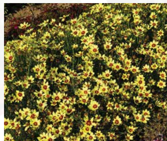
ELECTRIC SUNSHINE COREOPSIS ●●●

Height: 18 to 20 in. (46 to 51 cm) Spread: 22 to 24 in. (56 to 61 cm)