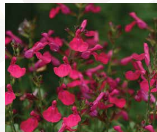
MIRAGE™ SALVIA SERIES ●●●

Height: 5 to 7 in. (13 to 18 cm) Spread: 36 to 48 in. (91 to 122 cm)