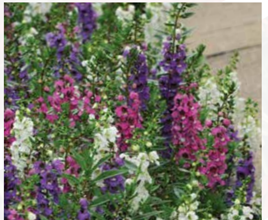
SERENITA® ANGELONIA SERIES ●●

Height: 20 to 28 in. (51 to 71 cm) Spread: 16 to 24 in. (41 to 61 cm)