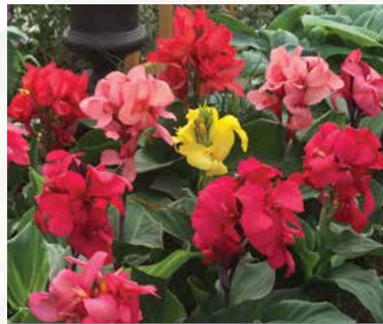
CANNOVA® CANNA SERIES ●●

Height: 14 to 20 in. (36 to 51 cm) Spread: 30 to 48 in. (76 to 122 cm)