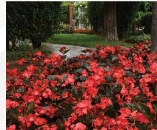
MEGAWATT™ BEGONIA SERIES ●●●

Height: 12 to 18 in. (30 to 46 cm) Spread: 12 to 18 in. (30 to 46 cm)