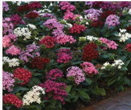
LUCKY STAR® PENTAS SERIES ●●

Height: 16 to 20 in. (41 to 51 cm) Spread: 16 to 20 in. (41 to 51 cm)