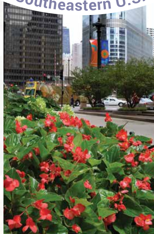
DRAGON WING® BEGONIA SERIES ●●●

Height: 12 to 16 in. (30 to 41 cm) Spread: 12 to 14 in. (30 to 36 cm)