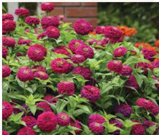
NEW ZESTY™ ZINNIA SERIES ●●●

Height: 8 in. (20 cm) Spread: 8 to 10 in. (20 to 25 cm)