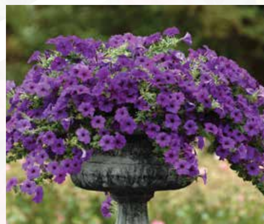
WAVE® PETUNIA SERIES ●●●

Height: 18 to 24 in. (46 to 61 cm) Spread: 18 to 24 in. (46 to 61 cm)