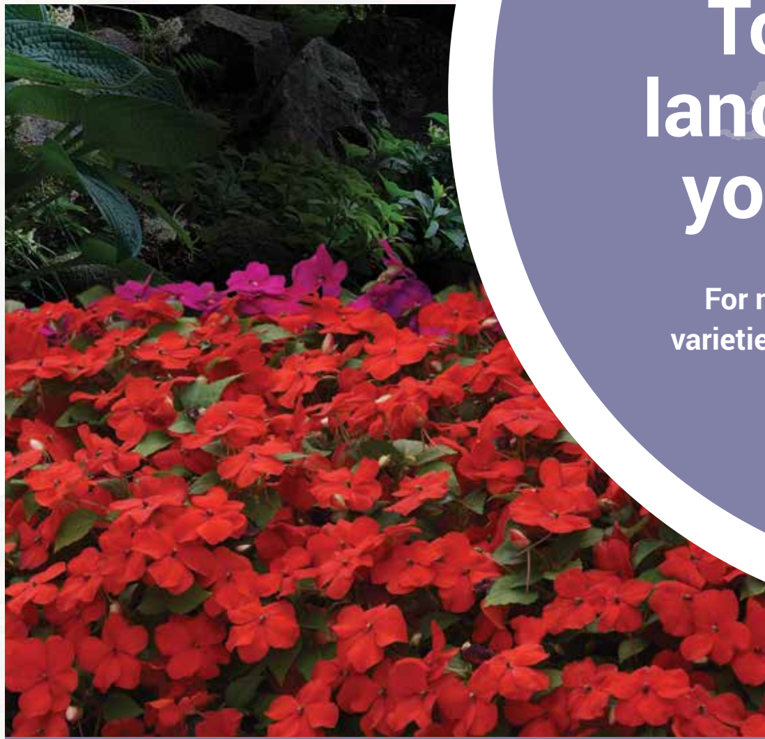
NEW BEACON® IMPATIENS SERIES ●●●

Height: 12 to 18 in. (30 to 46 cm) Spread: 15 to 18 in. (38 to 46 cm)