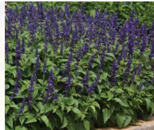
MYSTY SALVIA ●●

Height: 12 to 15 in. (30 to 38 cm) Spread: 15 to 18 in. (38 to 46 cm)