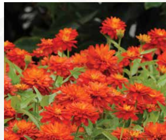
DOUBLE ZAHARA™ ZINNIA SERIES ●●●

Height: 18 to 24 in. (46 to 61 cm) Spread: 18 to 24 in. (46 to 61 cm)