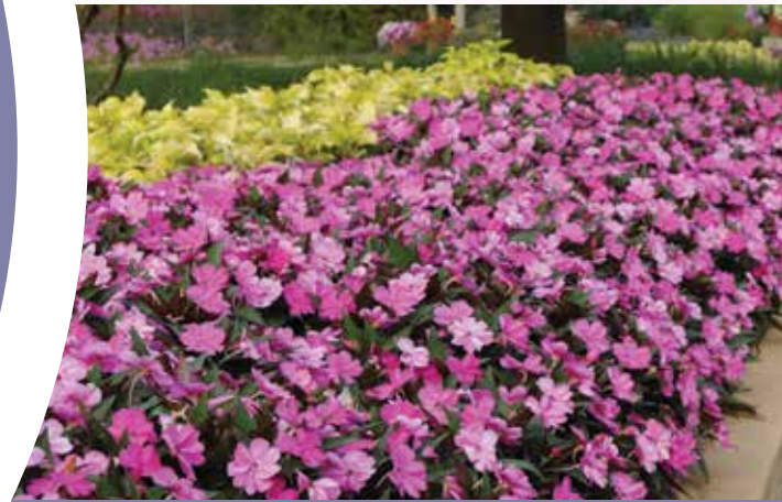
SUNPATIENS® COMPACT IMPATIENS SERIES ●●●

Height: 15 to 20 in. (38 to 51 cm) Spread: 12 to 14 in. (30 to 36 cm)