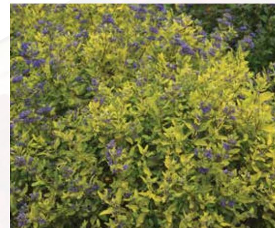
NEW GOLD CREST CARYOPTERIS ●●●

Height: 18 to 30 in. (46 to 76 cm) Spread: 10 to 20 in. (25 to 51 cm)