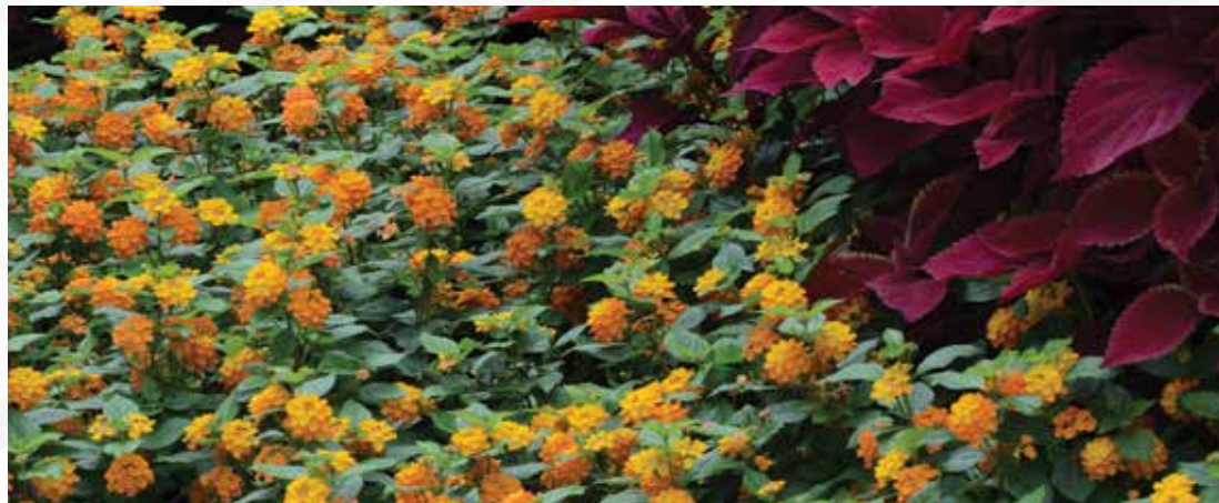
LUCKY™ LANTANA SERIES ●●

Height: 12 to 16 in. (30 to 41 cm) Spread: 12 to 14 in. (30 to 36 cm)