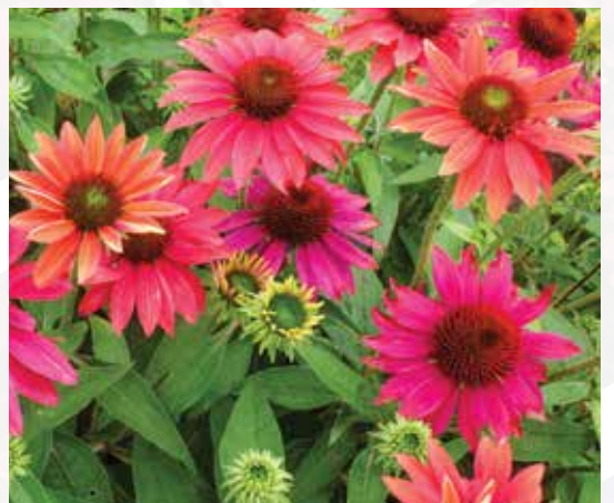
SOMBRERO® TRES AMIGOS ECHINACEA ●●●

Height: 28 to 36 in. (71 to 91 cm) Spread: 24 to 30 in. (61 to 76 cm)