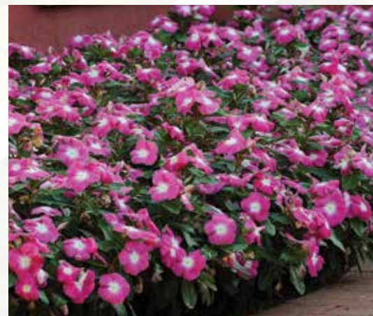
TITAN™ VINCA SERIES ●●●

Height: 16 to 20 in. (41 to 51 cm) Spread: 16 to 20 in. (41 to 51 cm)