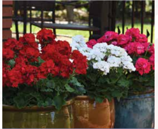
NEW GALAXY™ ZONAL GERANIUM SERIES ●●

Height: 12 to 18 in. (30 to 46 cm) Spread: 16 to 18 in. (41 to 46 cm)