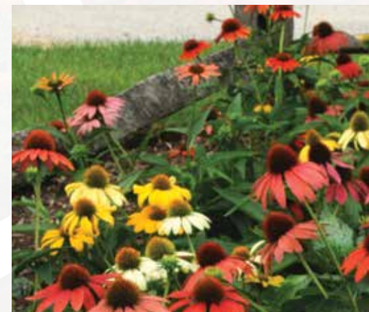
CHEYENNE SPIRIT ECHINACEA ●●●

Height: 14 to 16 in. (36 to 41 cm) Spread: 10 to 12 in. (25 to 30 cm)