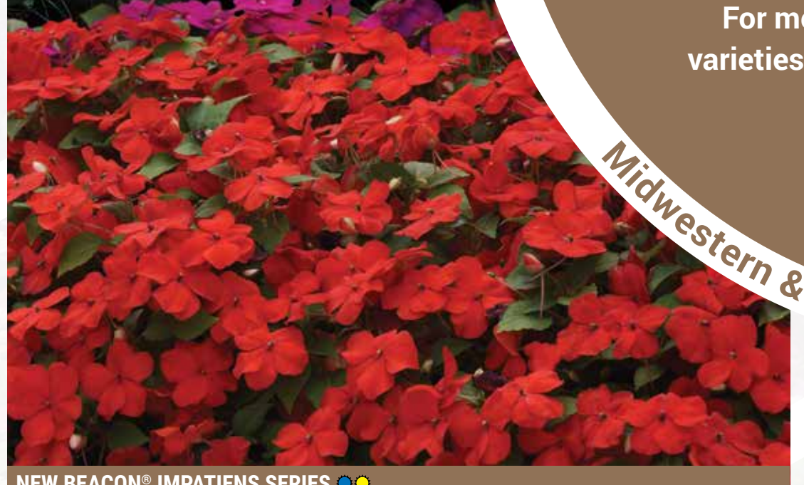
NEW BEACON® IMPATIENS SERIES OO

nt: 12 to 16 in. (30 to 41 cm) nd: 12 to 14 in. (30 to 36 cm)