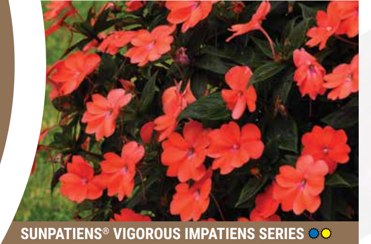
Height: 24 to 42 in. (61 to 107 cm) Spread: 24 to 30 in. (61 to 76 cm)