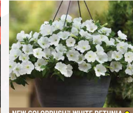
NEW COLORRUSH™ WHITE PETUNIA • eight: 10 to 12 in. (25 to 30 cm) pread: 24 to 36 in. (61 to 91 cm)