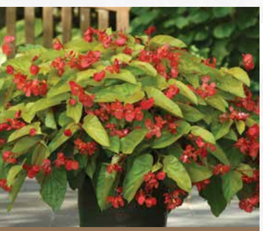
CANARY WINGS BEGONIA •