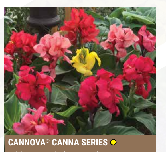
: 14 to 20 in. (36 to 51 cm) I: 30 to 48 in. (76 to 122 cm)