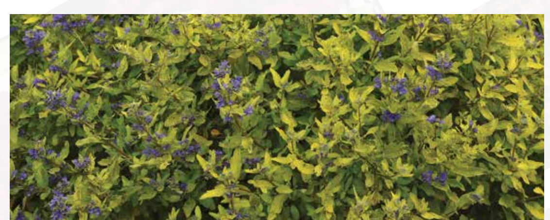
NEW GOLD CREST CARYOPTERIS ●●

Height: 5 to 7 in. (13 to 18 cm) Spread: 36 to 48 in. (91 to 122 cm)