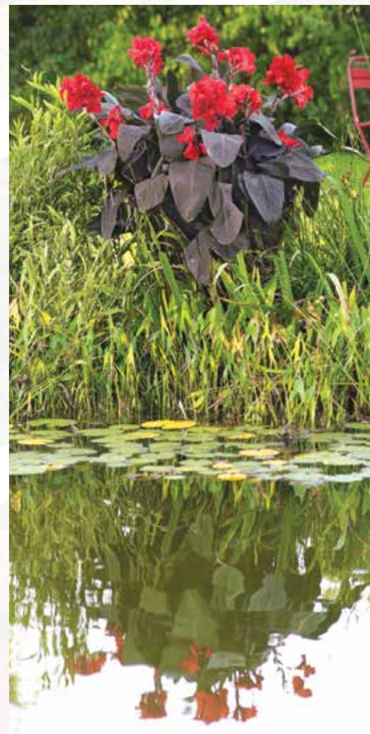
CANNOVA® CANNA SERIES ●

Height: 20 to 28 in. (51 to 71 cm) Spread: 16 to 24 in. (41 to 61 cm)