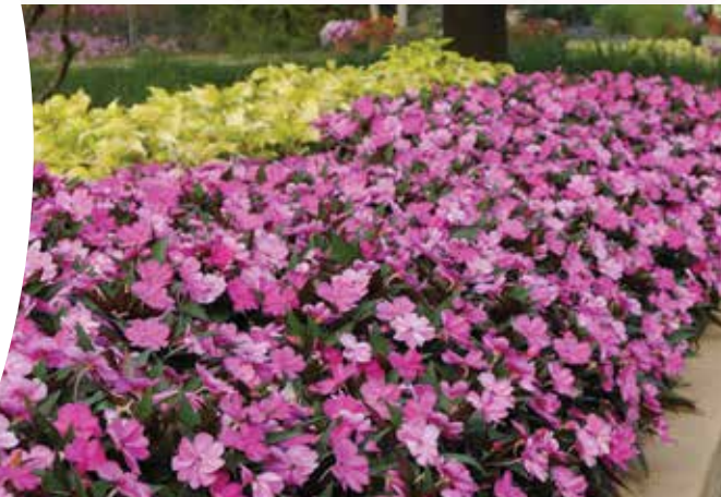
SUNPATIENS® COMPACT IMPATIENS SERIES ●●

Height: 15 to 20 in. (38 to 51 cm) Spread: 12 to 14 in. (30 to 36 cm)