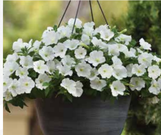
NEW COLORRUSH™ WHITE PETUNIA ●

Height: 12 to 18 in. (30 to 46 cm) Spread: 15 to 18 in. (38 to 46 cm)