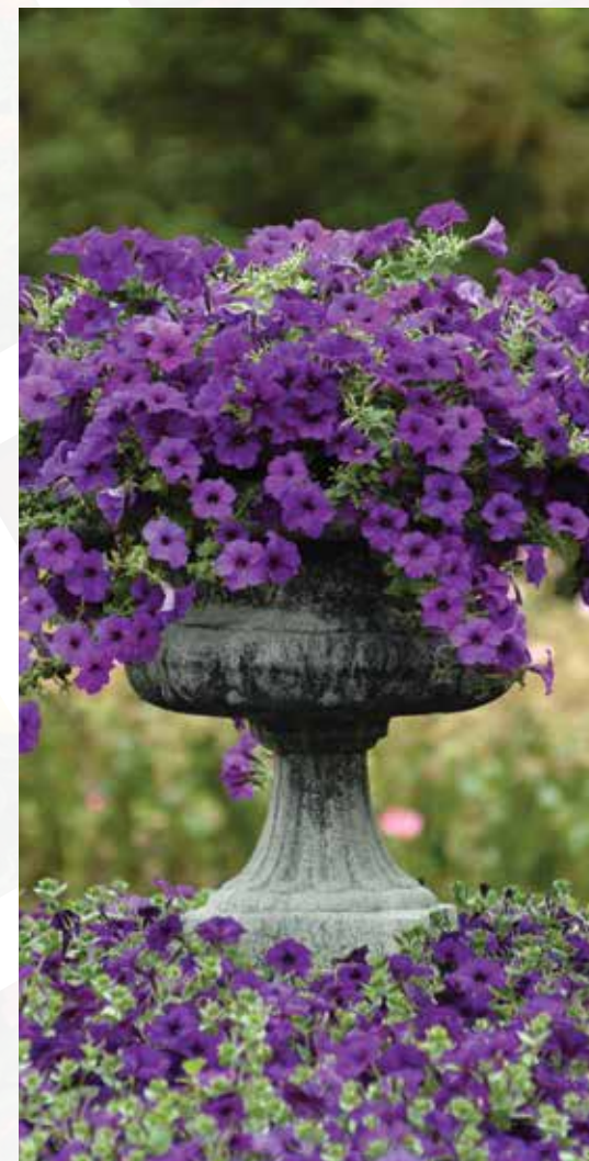
WAVE® PETUNIA SERIES ●

Height: 14 to 20 in. (36 to 51 cm) Spread: 30 to 48 in. (76 to 122 cm)