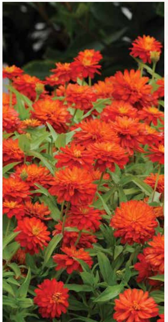
DOUBLE ZAHARA™ ZINNIA SERIES ●

Height: 14 to 28 in. (36 to 71 cm) Spread: 14 to 24 in. (36 to 61 cm)