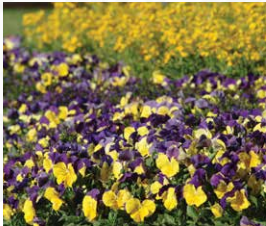
MATRIX® PANSY SERIES ●●

Height: 12 to 16 in. (30 to 41 cm) Spread: 12 to 14 in. (30 to 36 cm)