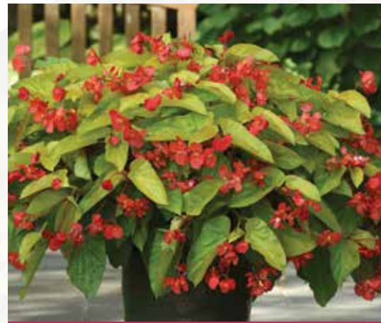
CANARY WINGS BEGONIA ●●

Height: 12 to 18 in. (30 to 46 cm) Spread: 15 to 18 in. (38 to 46 cm)