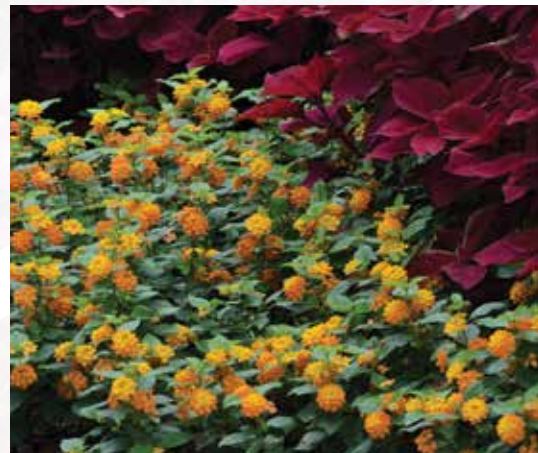
LUCKY™ LANTANA SERIES ●

Height: 12 to 18 in. (30 to 46 cm) Spread: 16 to 18 in. (41 to 46 cm)