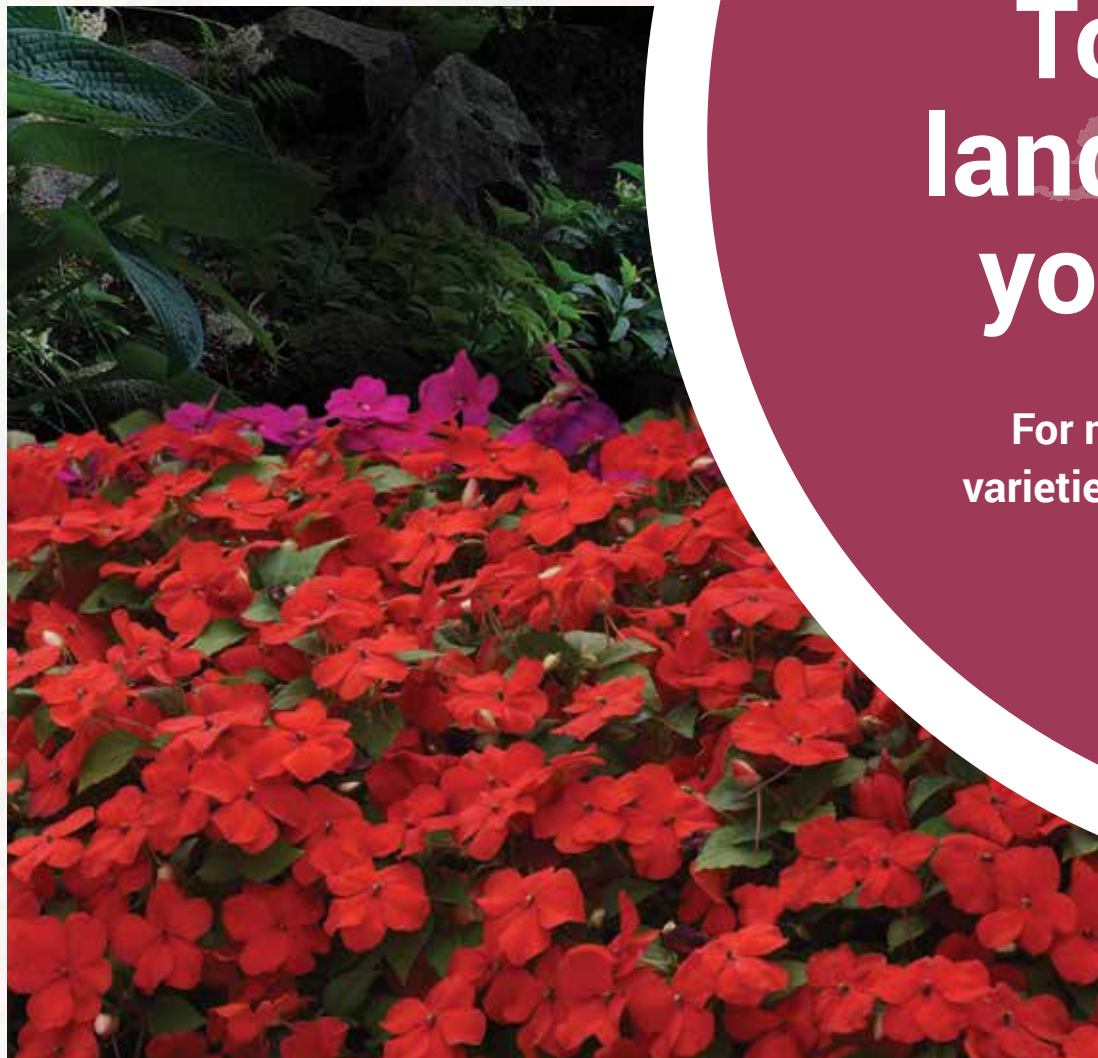
NEW BEACON® IMPATIENS SERIES ●●

Height: 10 to 12 in. (25 to 30 cm) Spread: 24 to 36 in. (61 to 91 cm)