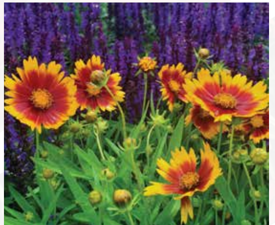
UPTICK™ GOLD & BRONZE COREOPSIS ●

Height: 18 to 24 in. (46 to 61 cm) Spread: 18 to 24 in. (46 to 61 cm)