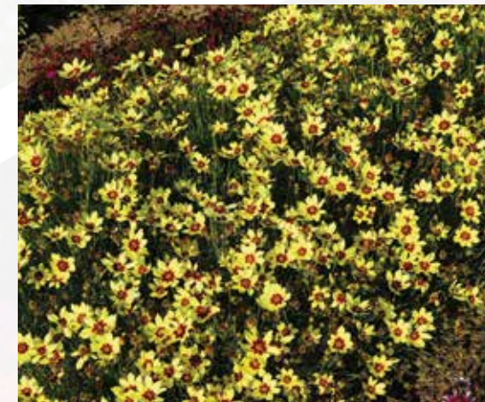
ELECTRIC SUNSHINE COREOPSIS ●

Height: 14 to 20 in. (36 to 51 cm) Spread: 10 to 12 in. (25 to 30 cm)