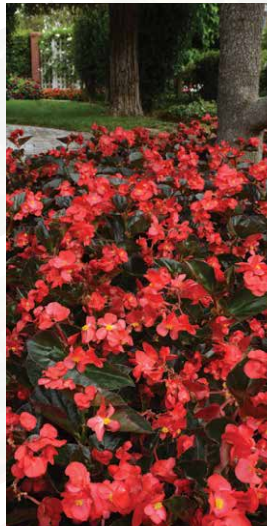
MEGAWATT™ BEGONIA SERIES ●●

Height: 12 to 16 in. (30 to 41 cm) Spread: 12 to 14 in. (30 to 36 cm)