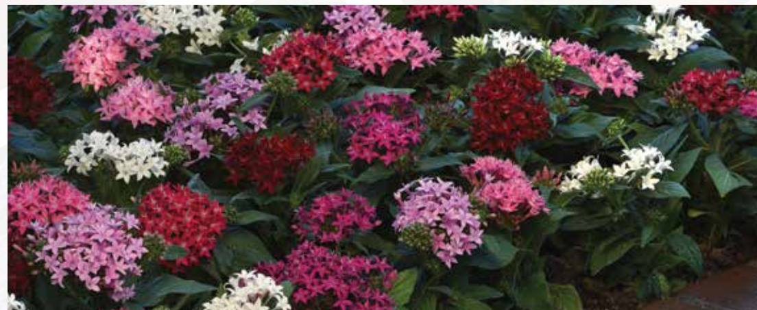
LUCKY STAR® PENTAS SERIES ●

Height: 12 to 14 in. (30 to 36 cm) Spread: 12 to 14 in. (30 to 36 cm)