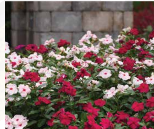
VALIANT™ VINCA SERIES ●

Height: 12 to 15 in. (30 to 38 cm) Spread: 15 to 18 in. (38 to 46 cm)