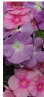
Cotton Candy Mixture