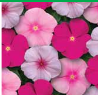
Bubble Gum Mixture